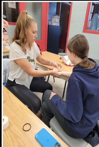
HW and AC SHSM Certification: Wrapping for Performance and Injury